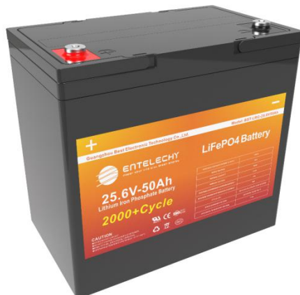
25.6V50Ah Battery outside picture

(Picture only for you reference, result depends on production)