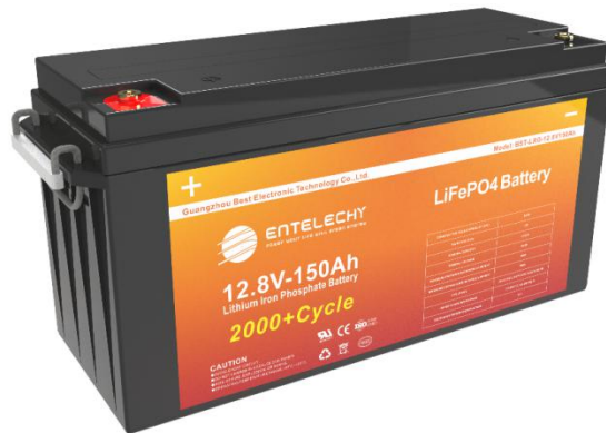
12V150Ah Battery outside picture (Picture only for you reference, result depends on production)

4.3.1 Battery bag outside picture (483*170*240mm without handle; tolerance class: GB/T1804-M)