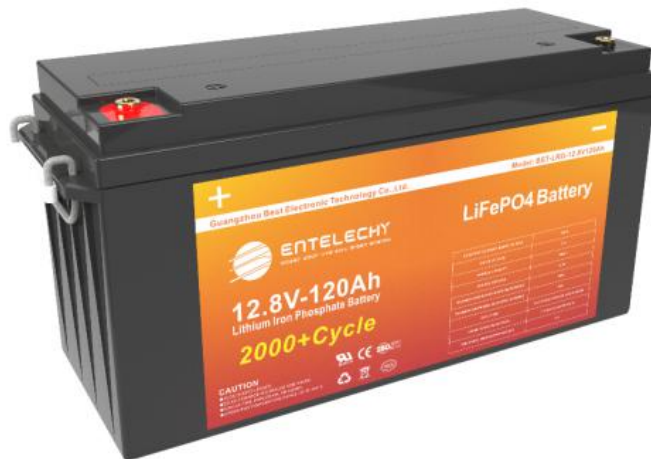
12V120Ah Battery outside picture ( Picture only for you reference,result depends on production )

4.3.1 Battery bag outside picture (483*170*240mm without handle; tolerance class: GB/T1804-M)