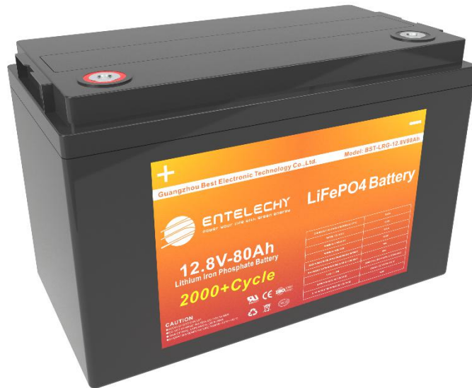
12V80Ah Battery outside picture (Picture only for you reference, result depends on production)

4.3.1 Battery bag outside picture (size:307*168*208mm; tolerance class:GB/T1804-M)