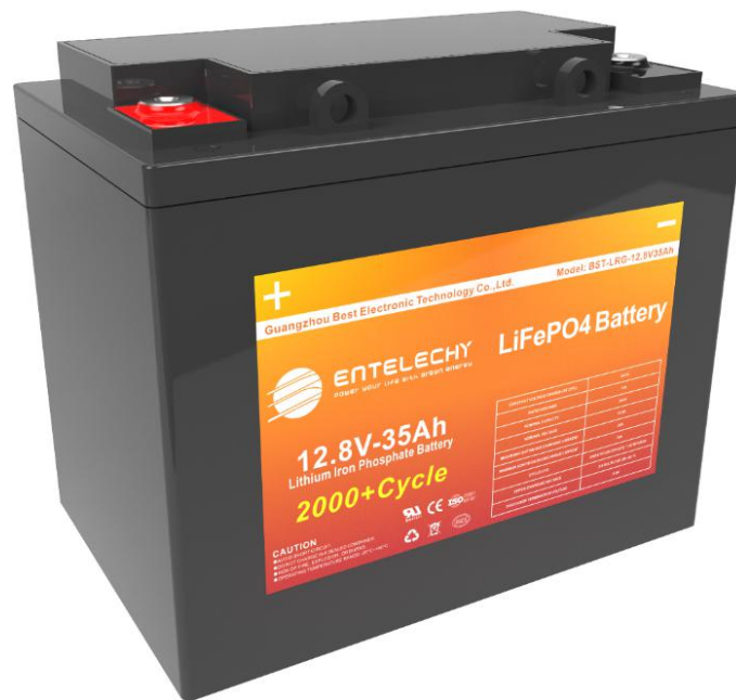
Figure 4-3 Battery size diagram